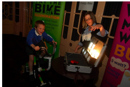
The Enviro zone – Energy Bike