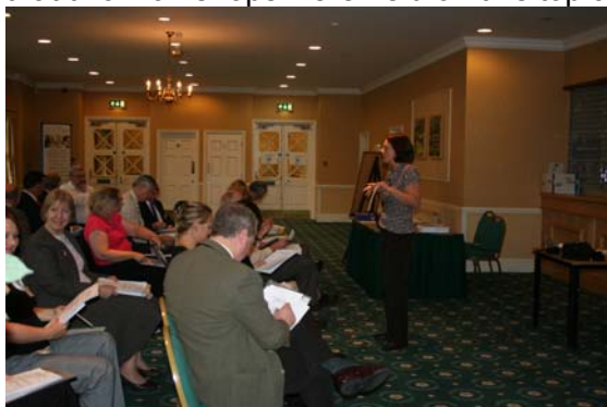
One of the workshops on the Framework at the NYSP Conference – October 2009

During 2009-10 opportunity has been taken to raise the profile of this work, including workshops, which were held as part of the NYSP Conference in October 2009. Demand for places was such that two workshops were held on this topic instead of the planned one.